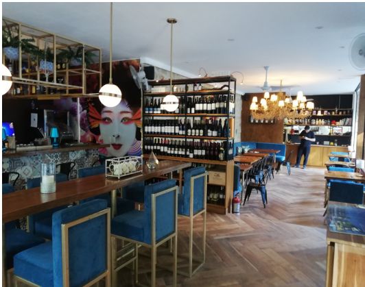
Citrus Restaurant and the New Plaza