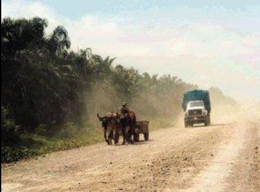
The Coastal Highway in 2009