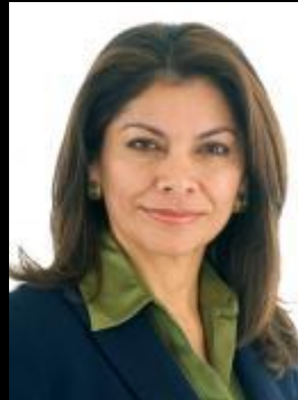
Laura Chinchilla new President