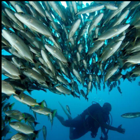
Diving off Cocos Island