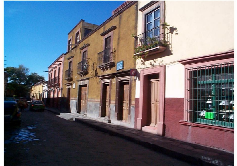
San Miguel Allende