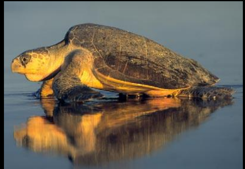
Olive Ridley Turtles