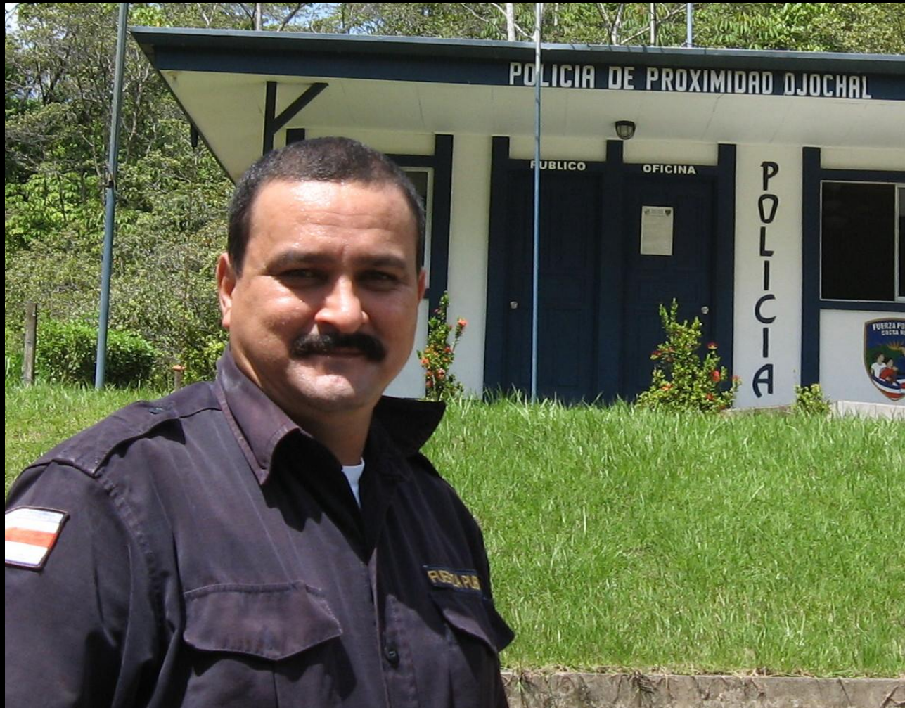
Our local policeman