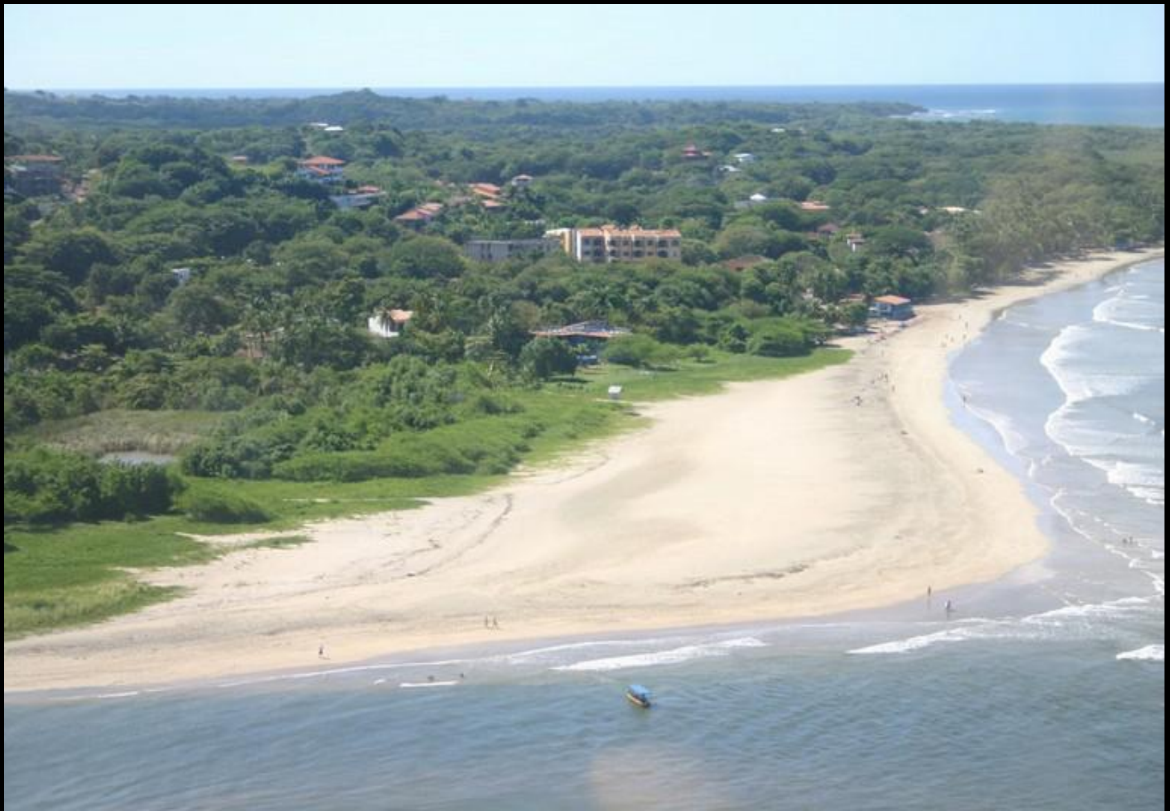
The Northern Pacific