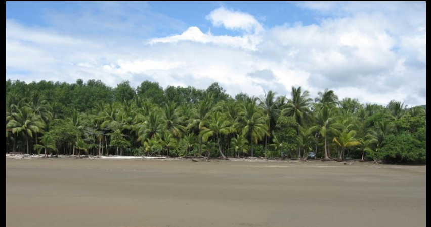
South Pacific Coast Beach