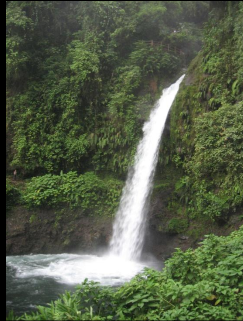
La Paz Waterfall