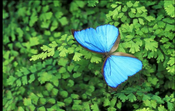
Blue Morpho Butterflies