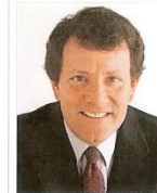
From left, Nicholas D. Kristof