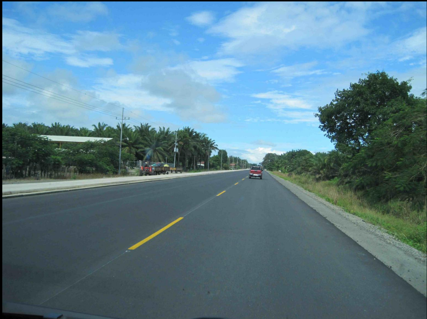
The Coastal Highway now