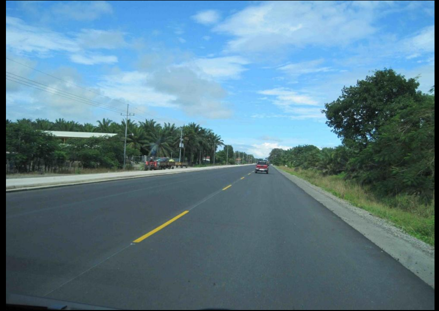
The Coastal Highway now