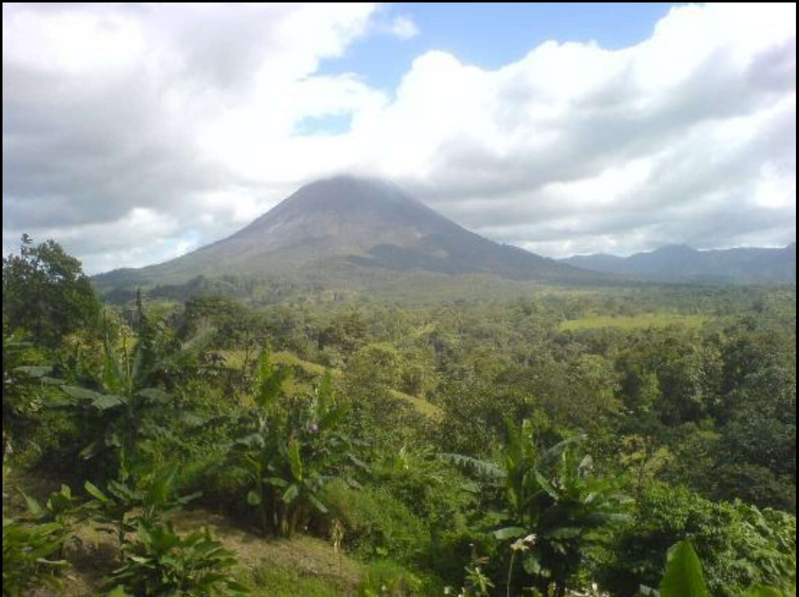
The Northern Plains