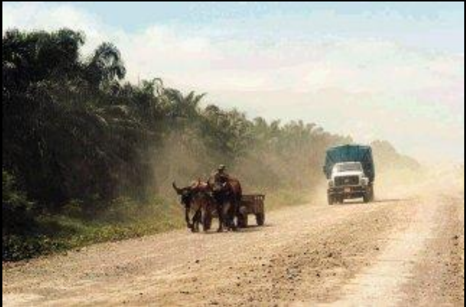
The Coastal Highway in 2009