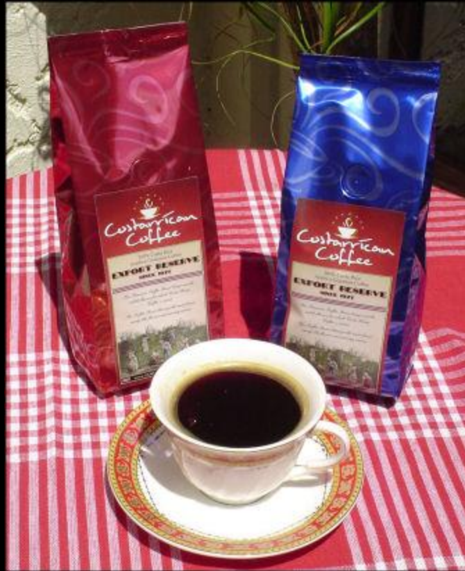
Costa Rican Coffee