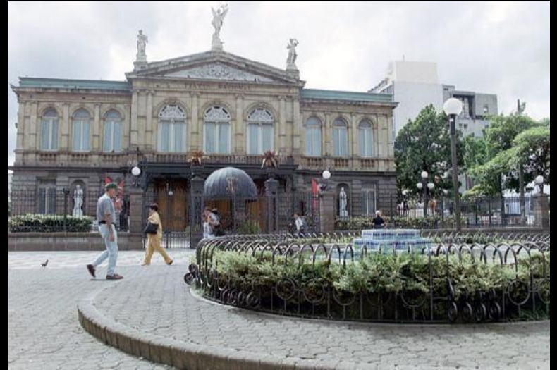
San Jose National Theater