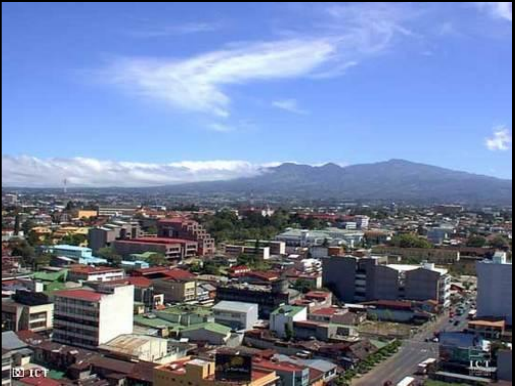
The Central Valley