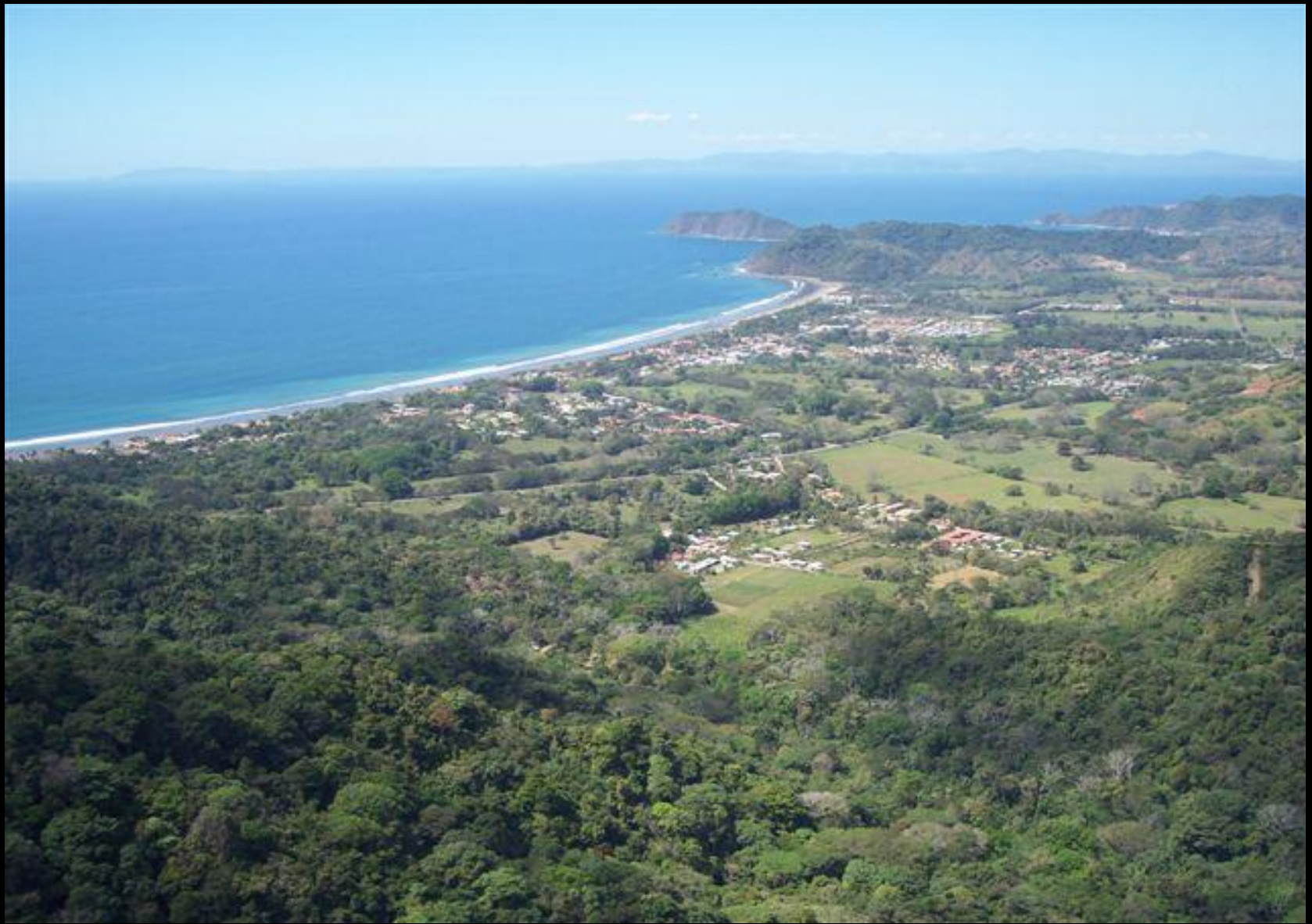
The Central Pacific