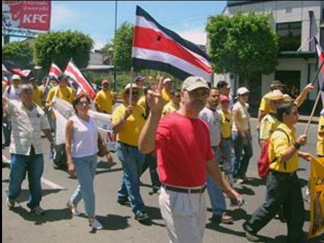
Costa Rican protest