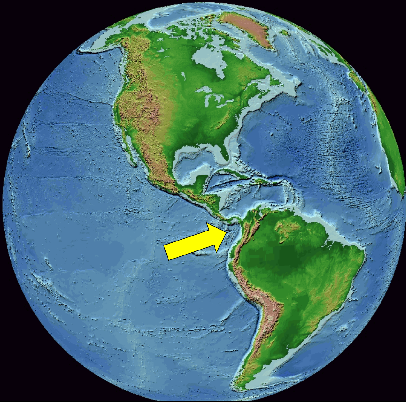
Costa Rica is in Central America between Nicaragua and Panama