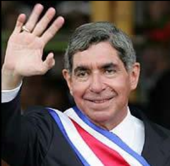
Dr. Oscar Arias, current President