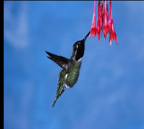
More than 50 kinds of Hummingbirds