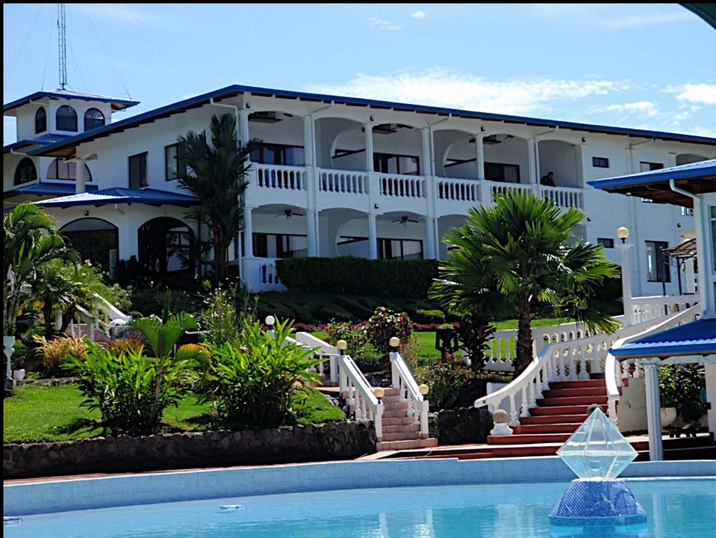
Cristal Ballena Hotel