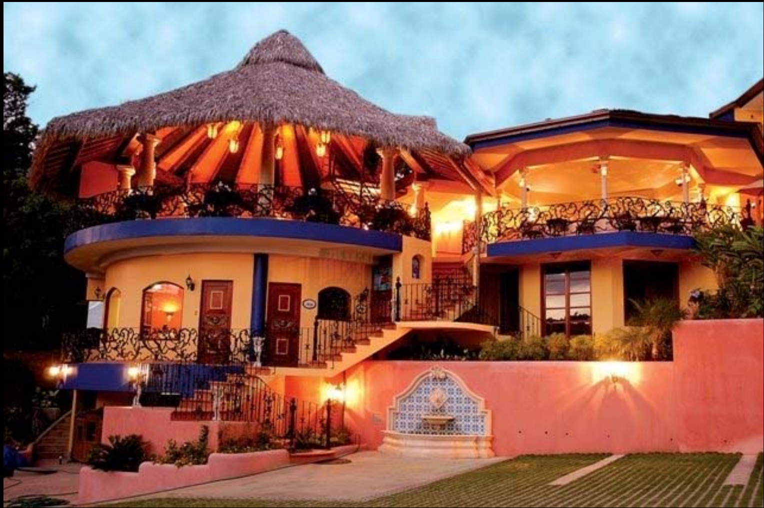
Cuna del Angel Hotel and Restaurant