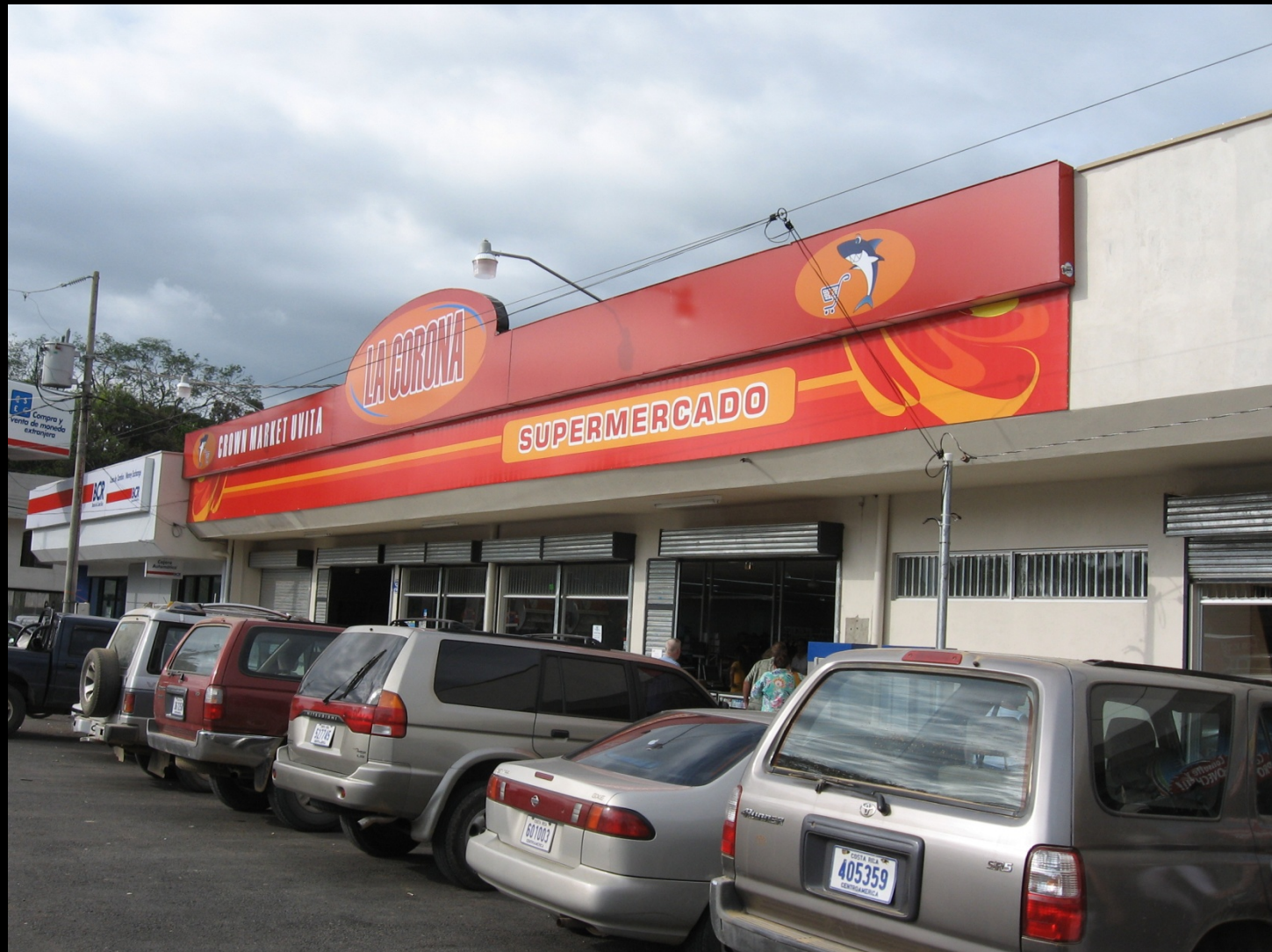
One of our local grocery stores