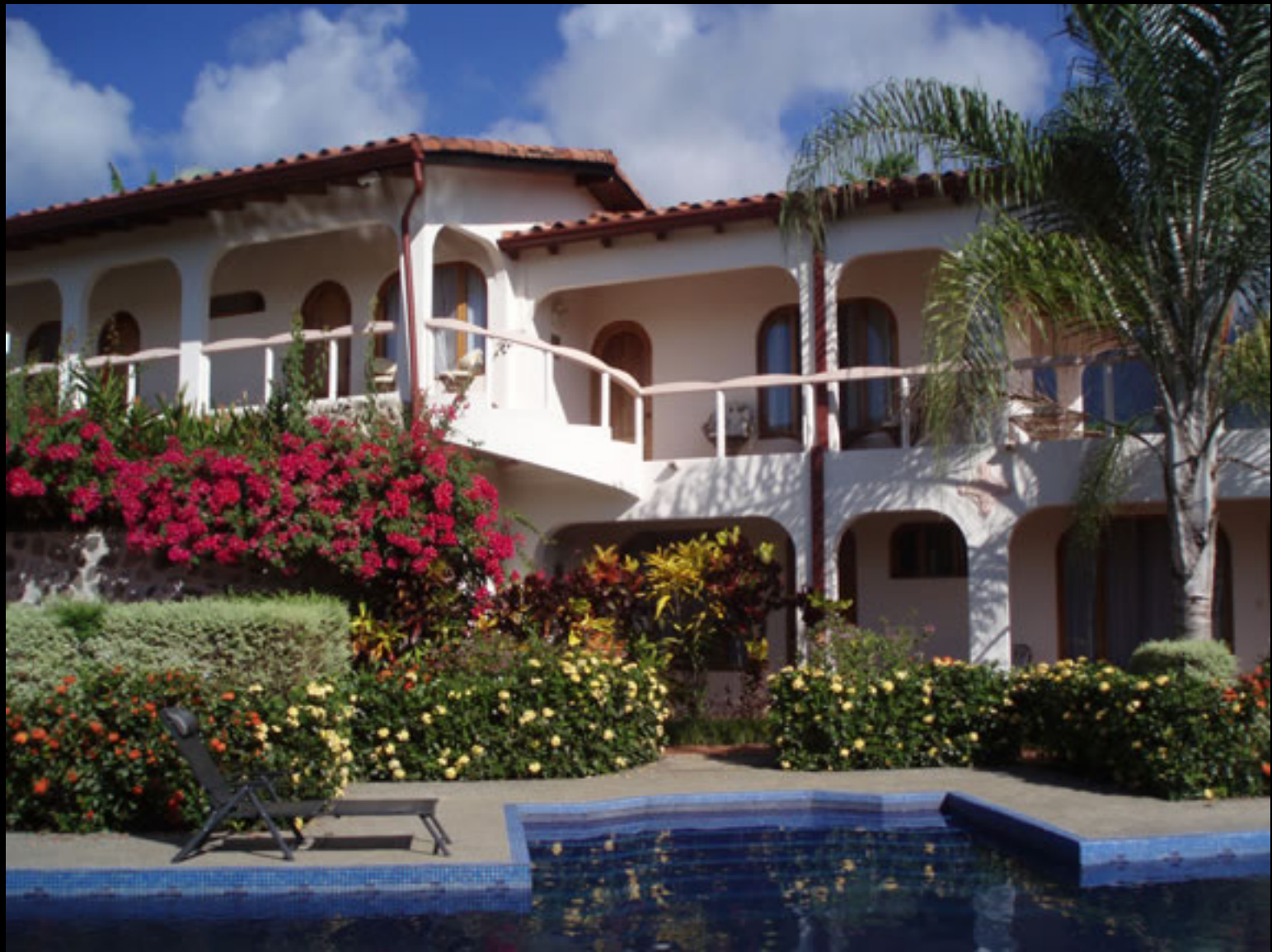
Our guest house