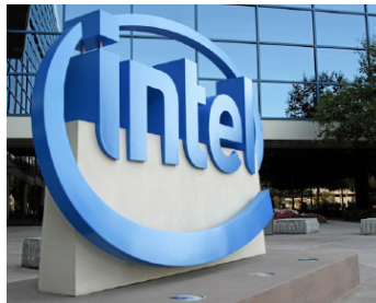
Intel is Costa Rica's largest employer

Costa Rica's top exports are: integrated circuits, medical equipment, bananas, pineapples, coffee, melons, ornamental plants, sugar, textiles and electronic components.